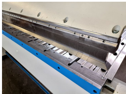
Zusätzliches Werkzeug anbei:

Vorsatzschiene 10 mm Spitzschiene R1 Spitzschiene R2